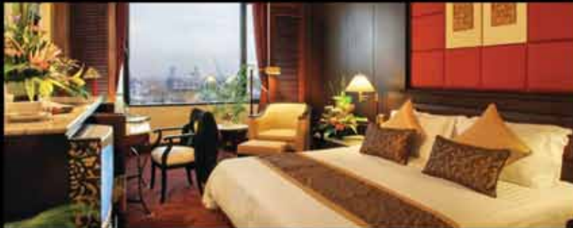
CHAOPHYA PARK HOTEL, BANGKOK

Short walk to subway station linking to the skytrain system