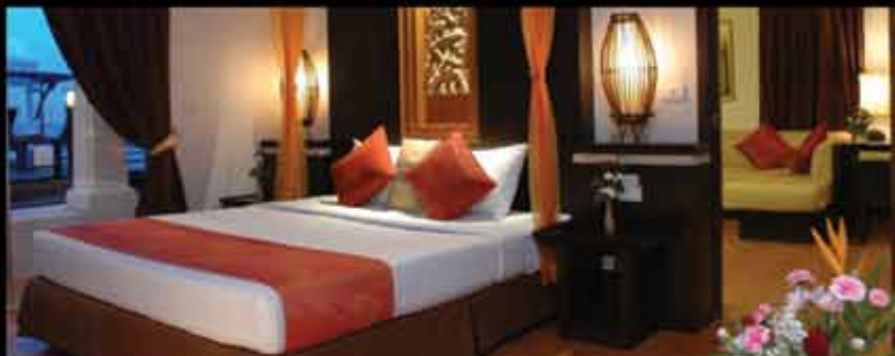
AL'S RESORT - CHAWENG BEACH, KOH SAMUI