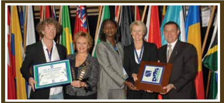
BASECAMP MASAI MARA – KENYA Submitted by Basecamp Explorer Group, Norway www.basecampexplorer.com