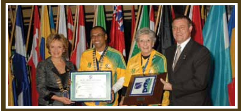
GOEDGEDACHT TRUST Submitted by Skål International Cape Town, South Africa www.goedgedachttrust.org.za