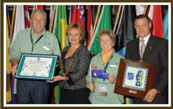
SUSTAINABLE ECOTOURISM Submitted by Daintree Discovery Centre, Australia - www.daintree-rec.com.au