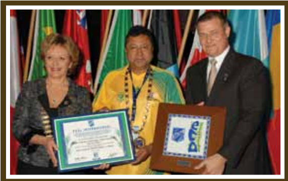
MIDLANDS MEANDER EDUCATION PROJECT Submitted by Midlands Meander Association, South Africa - www.mmaep.co.za