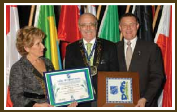
WE CARE – OPERATION PENGUIN Submitted by Choice Hotel Scandinavia, Norway www.choice.no